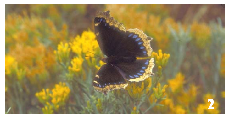
Fig.1) Riparian habitat in the Sacramento V alley looks fine, though reduced by an estimated 99-95% since the 19th Century . It is losing species faster than any other habitat type on our transect. This is a scene in the North Sacramento study site. Fig.2) The Mourning Cloak, Nymphalis antiopa, shown here visiting Rabbitbrush, Chrysothamnus nauseosus, at Donner P ass in the Sierra Nevada, has undergone a catastrophic decline near sea level on our transect in the past ten years, but its troubles may be related to its rhythm of annual altitudinal migration. Fig. 3) The familiar Acmon Blue, Plebejus acmon, shown on a Smartweed (Polygonum) flower in a drainage ditch at our W est Sacramento site, is one of the "weedy" species that seem to be suffering from loss of habitat at low elevations-leading to a decrease in occurrence in the mountains, where it is an immigrant. Fig. 4) Here at tree-line on Castle Peak in the Sierra Nevada, more and more lowerelevation species are turning up as strays. Meanwhile, the true highaltitude species, such as the Ivallda Arctic ( Oeneis chryxus ivallda), found in this rubble-strewn rock garden, appear to be in decline.